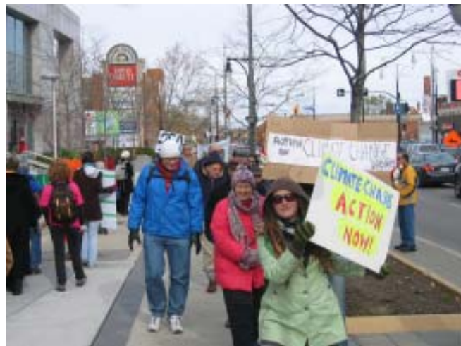
Some of the 60 people who demonstrated on November 18 outside the Federal Building.

You can all the Ministry to report any pollution - from soot in your backyard to a strange odour – at 905.521.7650 during office hours, or their 24-hour hotline 1.800.268.6060. And if your neighbours share your concern, get them to call too: the more reports made, the better.